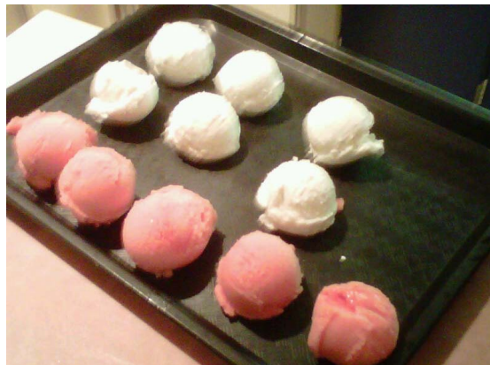
Sorbet and coconut milk ice cream, getting ready for the limelight.

Doing this segment brought to mind a wealth of other combo ideas (rhubarb Dry Soda and strawberry gelato, anyone?). What are some of your favorite float combos? I also learned just how you make real ice cream look good on live television: scoop in advance and re-freeze!