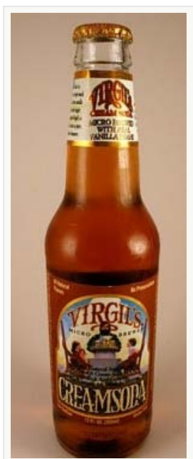
Creepy under-aged kids being served beer by a lumberjack dude label on the outside, golden deliciousness on the inside.

15. DEC, 2010 CATEGORIES: SODA REVIEWS BY MRRONG VIEW COMMENTS