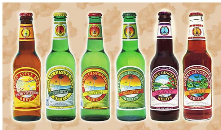
Any and all of the above. Reed's ginger ale is deliiiiicious.

Okay, I bought some ginger ale yesterday, but I think I need more – like enough to bath in. At least bathing in ginger ale would be more exciting than sitting on a couch. All day. Every day.